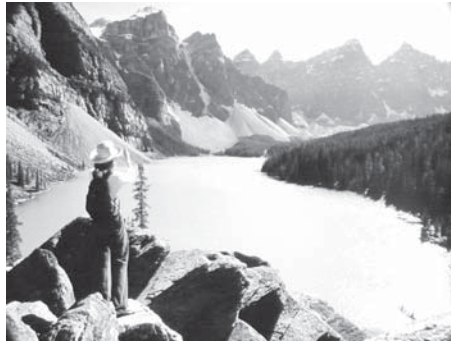
Fig.1: The experienced landscape

Understood in this sense, as experienced landscape , the landscape is probably as old as mankind (see figure 1). Like all other organisms, humans ( Hominids ), which appeared about 2,5 million years ago in the biophysical landscape, are characterized by a boundary (a semipermeable membrane between inner and outer reality), and as a result are able to interact with their environment ( Umwelt ). Homo sapiens , who appeared on stage about 200.000 to 100.000 ago and is the only species of the genus of hominids that has survived the struggle for life, not only interacts with its environment, but – as a selfconscious animal - is also aware of this environment, and for that reason is able to reflect on it.