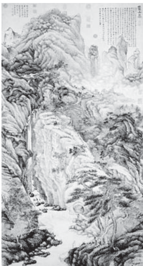
Fig. 11 Shen Zhou, Lofty Mount Lu, 1467

However, because of the absence of the scientific perspectivism, the overall atmosphere of the Chinese landscape painting is one of harmony; the human figure does not stand opposite the landscape, but rather is part of it and feels himself at home in it. The classical Chinese landscape expresses an interconnected cosmology that in the European landscape since the Renaissance gradually has been destroyed. According to Lemaire, Eastern culture is still characterized by this harmonious relationship with nature, and as such stands in a radical opposition to Western culture