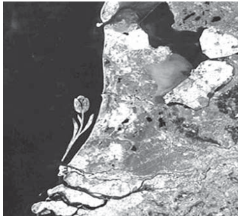
Fig.16 NextNature. Design Polder, 2012

Here the pendulum is swinging back: whereas the sublime transformed from a natural to a technological category in the twentieth century, in the twenty-first century we are experiencing the technological sublime as a natural phenomenon again. 37) This may also apply for virtual landscapes, which literary may come alive, when they become the scene of genetic algorithms, artificial life forms and hybrids. These landscapes may become sublime biotechnological hybrids of natural and artificial life forms.