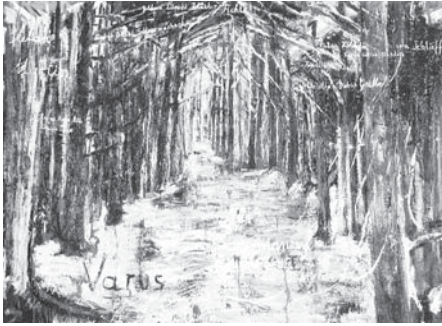
Fig. 9 Anselm Kiefer, Varus, 1976