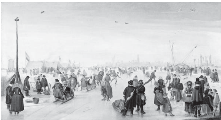
Fig.5 Hendrick Avercamp, Winterlandscape with skaters near the city Kampen, ca. 1615

Due to this act of liberation the landscape loses its sacred dimension and becomes a profane space, open for scientific exploration and technological control. 19) The further development of the European landscape painting until early Romanticism shows how, after the initial exploration of the landscape, the profane landscape gradually becomes a place of human settlement. Especially the anecdotic Dutch landscape paintings from the 16 th and 17 th century reflect how the modern Europeans cultivated, and settled in, the (bio)physical landscape (see figure 5) . 20)