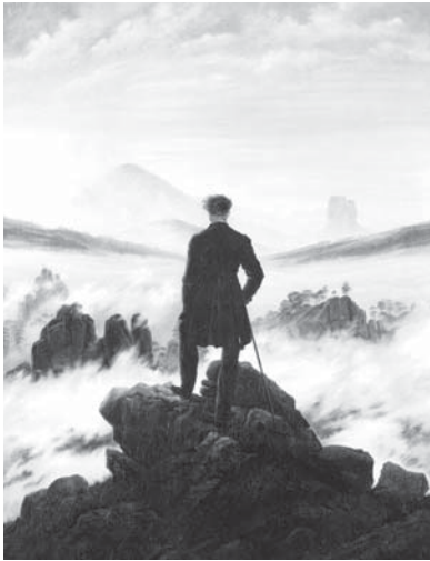
Fig.6 Casper David Friedrich, Wanderer above the Sea of Fog, 1818

for a reunification and reconciliation with nature, but also his inability to realize this desire (see figure 6).