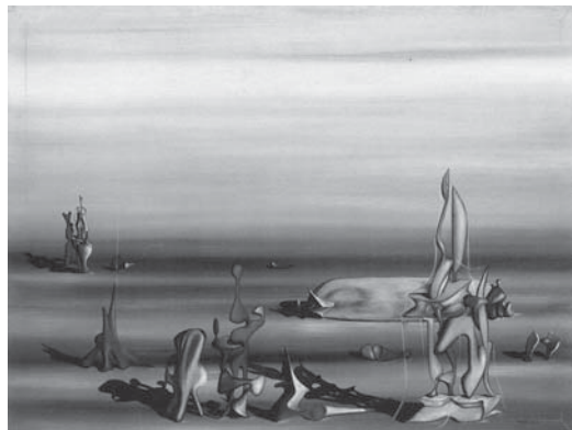
Fig.8 Yves Tanguy, Untitled, 1937

In the metaphysical and surrealist landscapes of 20 th century avant-gardist like De Chirico and Tanguy (see figure 8), we have arrived “in a strange, ominous, and dehumanized world, in which the reconciliation of man and nature, that seemed to have been realized in the impressionistic landscape, has turned to its opposite.” 21) And although Lemaire’s reconstruction – his book was first published in 1970 – ends with the avant-garde movements before the Second World War, we could easily continue the reconstruction of this process of alienation. We could think, for example, of the hideous forests of Kiefer (see figure 9) or the dark landscapes of a contemporary Dutch artist like Alex van der Kraan, in which nature has been replaced completely with industrial complexes (see figure 10).