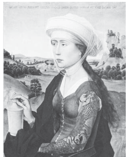
Fig.4 Rogier van de Weyden, Portrait of Maria Magdalena , 1450