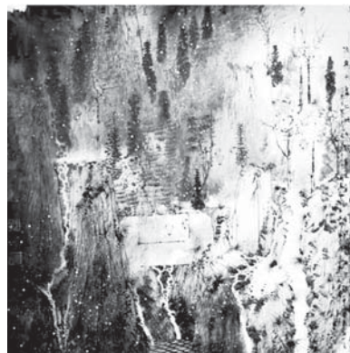
Fig.12, Lu Yushun, Being at ease in the mountains, 2012