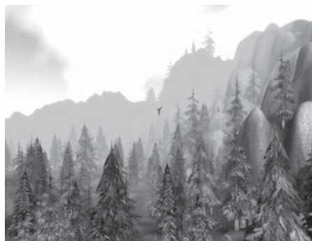
Fig.15 World of Warcraft Landscape, 2013

Even more virtual are completely virtual worlds like Second Life and World of Warcraft , in which nowadays millions of people spend an often impressive amount of their leisure or work time (see figure 15). Although the rendering of these worlds require the physicality of computers, servers, cables, wifi routers etc., they are virtual in the sense that they are not real, analogue (bio)physical landscapes, but digital simulations of real or fictive landscapes. At first such landscapes appear to be the (tentatively) last stage in the history of the represented landscape. However, the difference is that these representations function as real environments in the sense that they enable their ‘inhabitants’ to interact