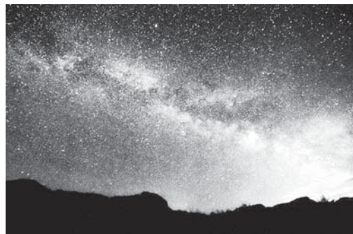
Fig.14 The mathematical sublime

Second , the modern sublime is strongly contrasted to beauty. Beautiful things give us a pleasant feeling. They feed our hope that we