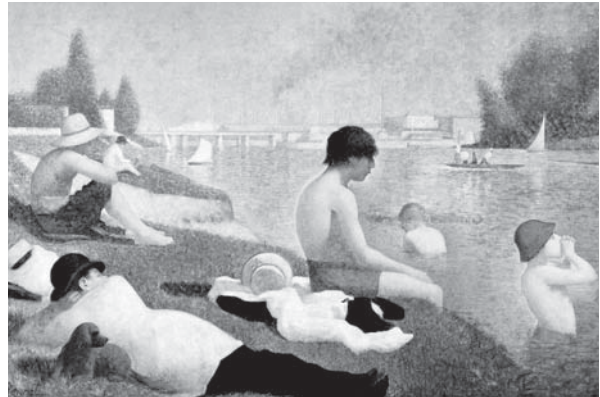
Fig.7 Georges Seurat, Bathers at Asnières, 1884

After a short-lived last attempt to reconcile nature and culture in the impressionistic depiction of the public space of the 19 th century suburb (see figure 7) the isolation of the modern subject results in a fundamental alienation.