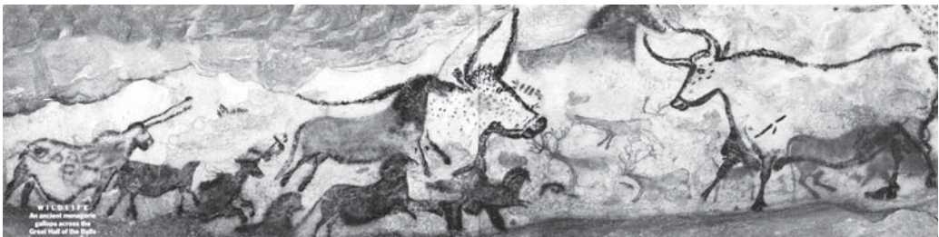
Fig.2 Prehistoric cave painting

At least, this is what we may infer from the surviving “landscapes” in the third sense of the word, referring to “ pictures representing a view of natural inland sceneries. ” 2) On the scale of human history, depictions of the environment have a respectable history, too. We already find rudimentary paintings of landscapes in prehistoric cave paintings and petroglyphs all over the world, dating back at least 40,000 years (see figure 2).