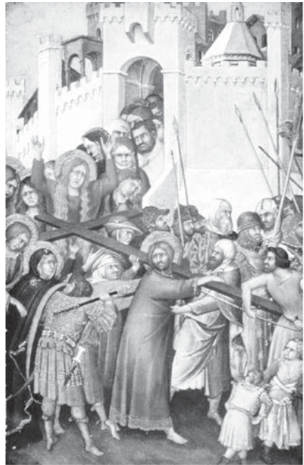
Fig. 3 Simone Martini, The Road to Calvary , ca. 1340

According to Lemaire, mediaeval man had to throw the 'outer world' out of himself, and had to learn to recognize its otherness in order to become aware of himself as an individual subject. In the central perspective the human figure is no longer immediately absorbed in the world-space, but rather places himself vis-à-vis the world. In The Philosophy of the Landscape , Lemaire expressed this as follows: "The perspectival representation of the world as landscape is an act of liberation and emancipation by the individual, or, more cogently expressed: it is via one and the same movement that the individual places himself as an autonomous subject and the world appears as an environmental space." 14) With respect to Rogier van der Weyden's Portrait of Maria Magdalena , Lemaire adds: "That which was the achievement and inspiration of the Renaissance is here reduced to an elementary image: the awakening of the self-conscious person against the background of the world, the self-differentiation of the subject who separates himself from the world in order to be able to see it in overview and to control it. The subject has liberated himself by distancing itself from the world, it has become autonomous by making a secret dimension of himself visible and calculable." 15) This attainment is